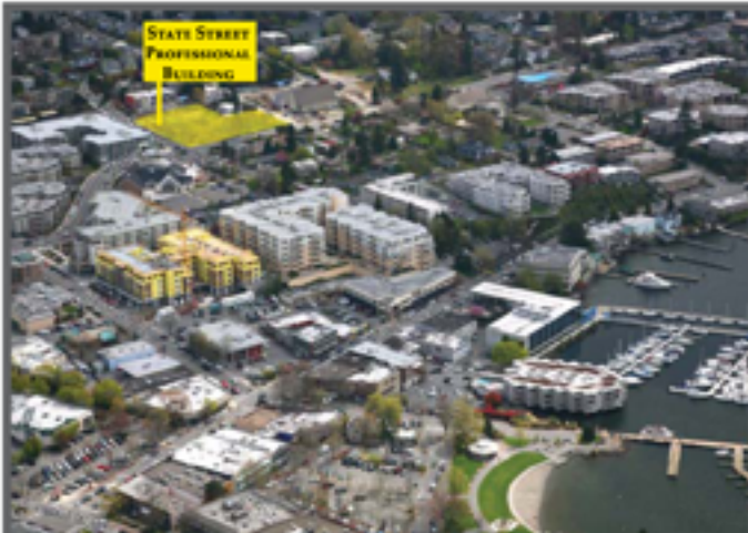
State Street Professional Kirkland, WA Price: $3,900,000 - Size: 44,991 sq ft