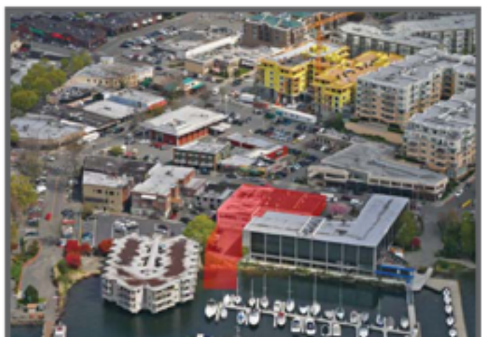
123-29 Lake Street South Kirkland, WA Price: $8,500,000 - Size: 21,034 sq ft