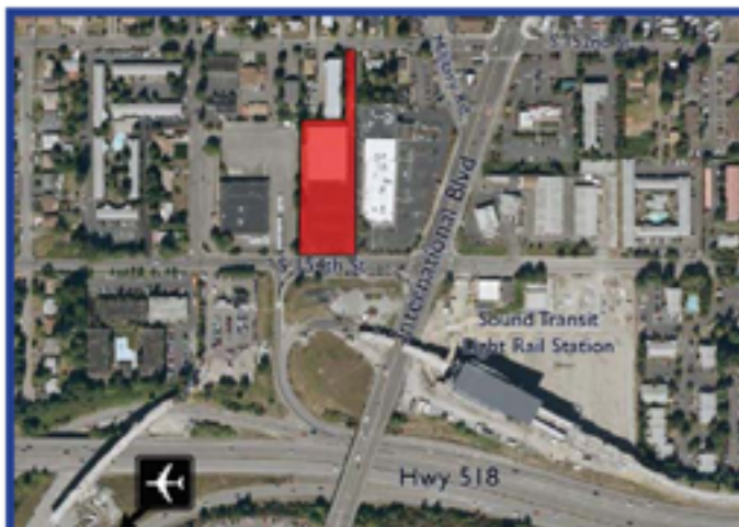
370 Units at Seatac Center Seatac, WA Price: $9,954,000 - Size: 72,236 sq ft